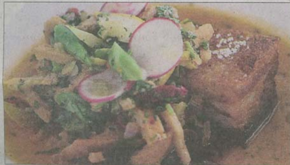
Tripe stew, pork belly and cilantro at the Abattoir, one of the restaurants that give Atlanta its reputation for great places to eat.

» Meridith Ford Goldman shares the best places to get a delicious meal for less than $30. E4