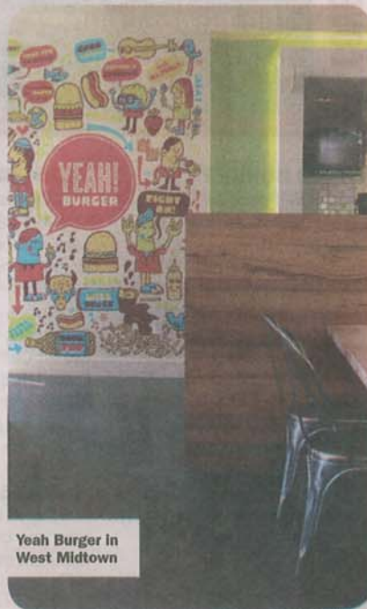
Yeah Burger in West Midtown

Farm Burger’s small space is packed with picnic tables, and there are a handful of seats on the front patio. It’s likely to be loud and crowded, and no one will look twice if you lick your fingers. SP