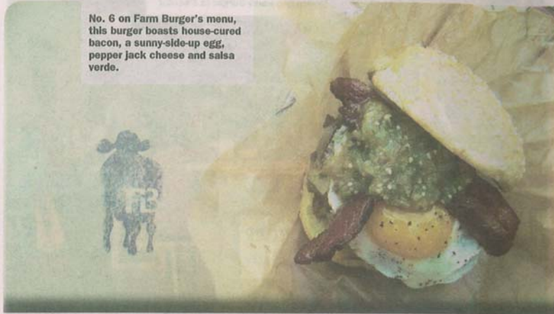
No. 6 on Farm Burger's menu, this burger boasts house-cured bacon, a sunny-side-up egg, pepper jack cheese and salsa verde.