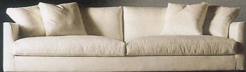
AVA's Luxe Sofa