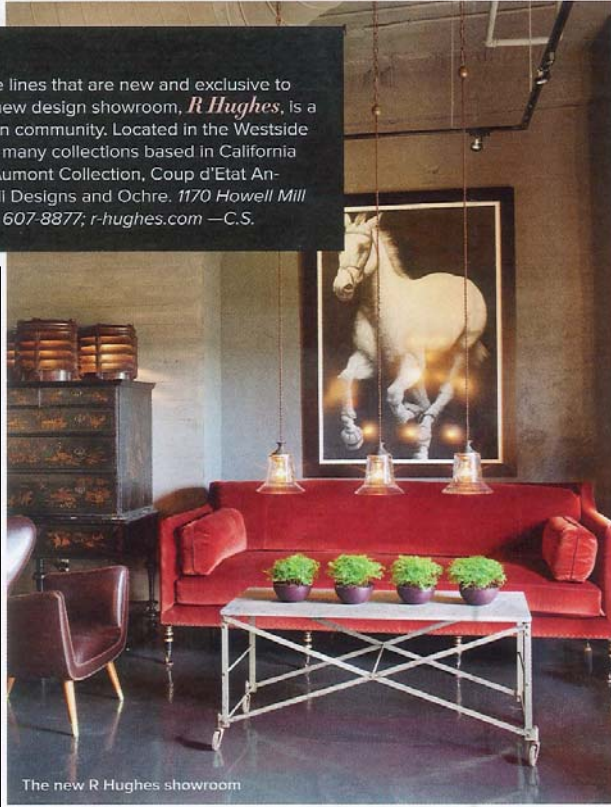
The new R Hughes showroom