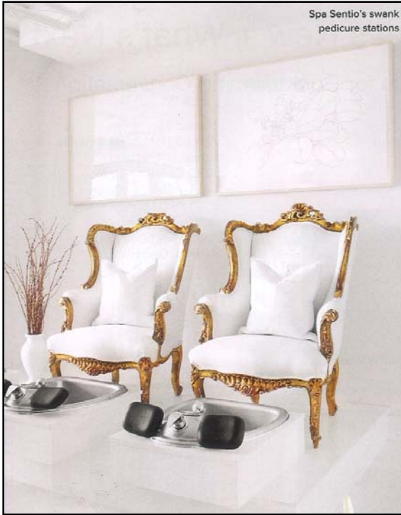
Spa Sentio's swank pedicure stations