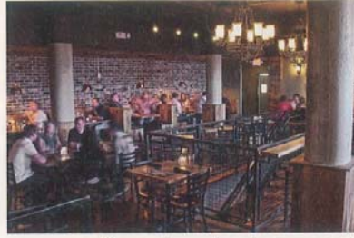
The restaurant and amusements