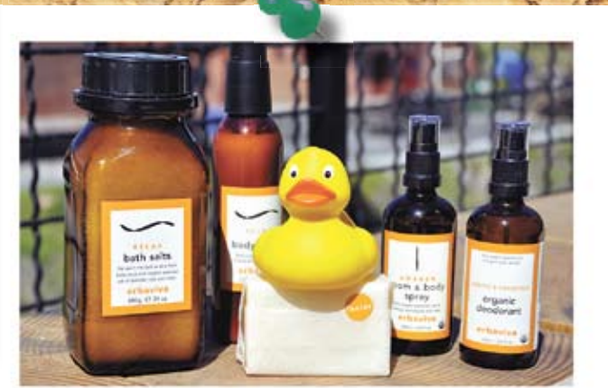
erbaviva bath products for mom & baby at Sprout & Seed Factory