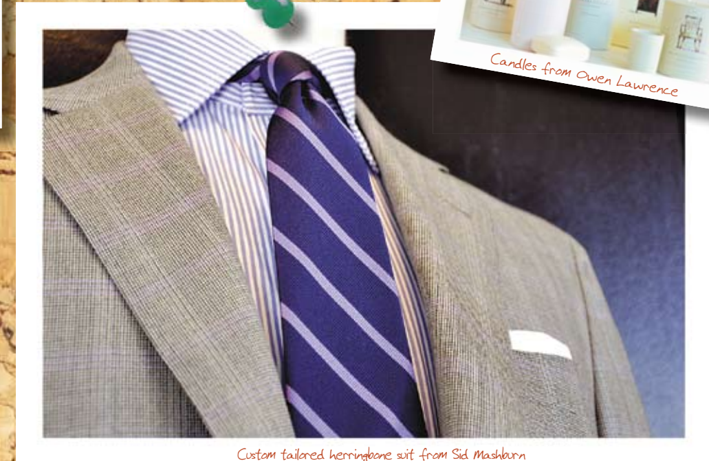
Custom tailored herringbone suit from Sid Mashburn