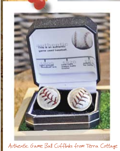
Authentic Game Ball Cufflinks from Terra Cottage