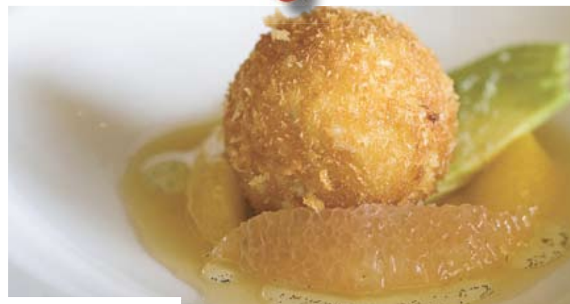
Bacchanalia's Yummy Gulf Crab Fritter