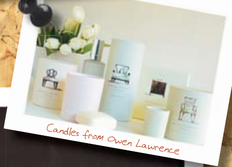
Candles from Owen Lawrence