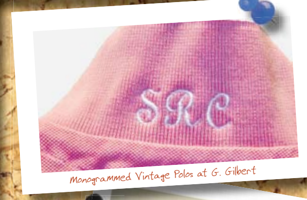
Monogrammed Vintage Polos at G. Gilbert