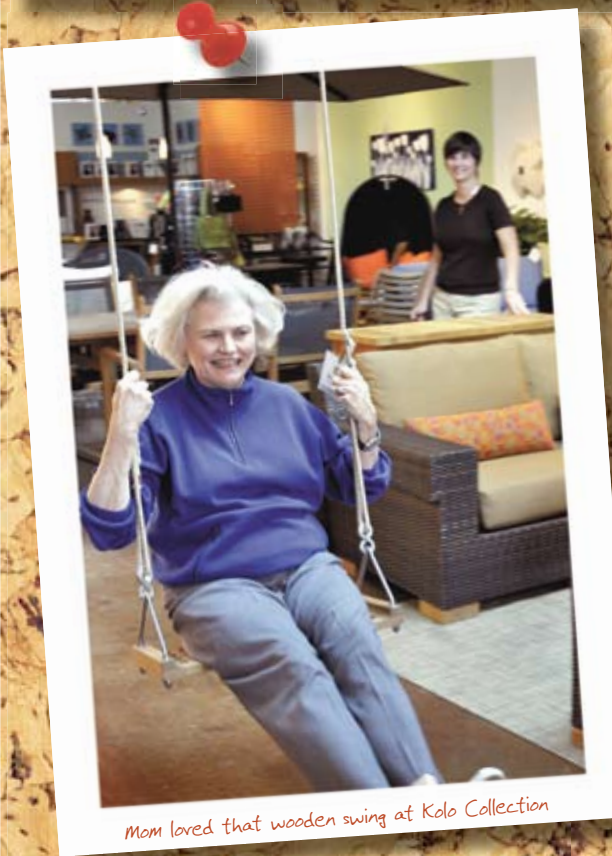
Mom loved that wooden swing at Kolo Collection

Find awesome gifts for the unique Mom or Dad in your life at Westside Provisions District